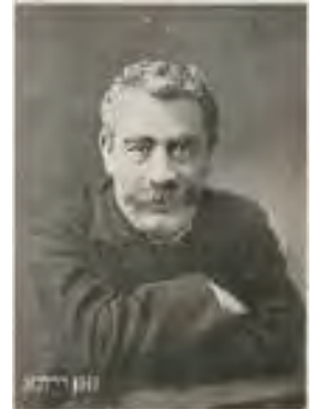
Peretz depicted on an old Yiddish-language postcard

At the marking of Yom Kippur in Toronto UJPO, the story of the poor woman who is visited by a Rabbi in disguise of a gentile woodcutter, bringing her firewood, has often been presented. This is one of I.L. Peretz's most famous stories, "If Not Yet Higher", ( Oyb Nisht Nokh Hekher ). The Rabbi's congregation had been wondering, "Where does the Rabbi of Nemirov disappear to when he should be at Penitent Prayers ( slikhot )